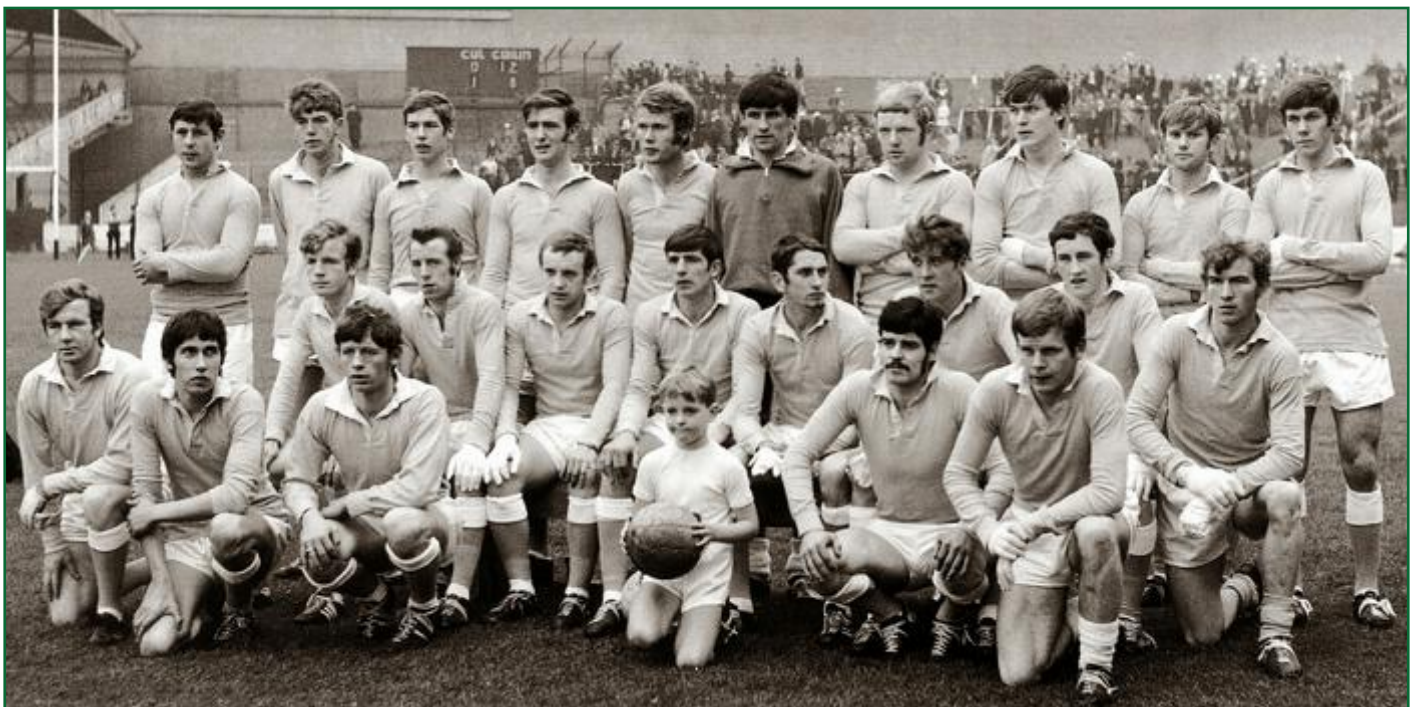
The Antrim team that beat Roscommon in the 1969 All Ireland Under 21 Football final in Croke Park

This is an exciting and challenging juncture in the development of gaelic games in Ireland's second city. Gaelfast will seek to harness all of the energy and the best ideas, including those set out in this strategy, within a Gaelfast Plan for the next 10-15 years which embraces and uplifts All Codes, All County and All Communities.