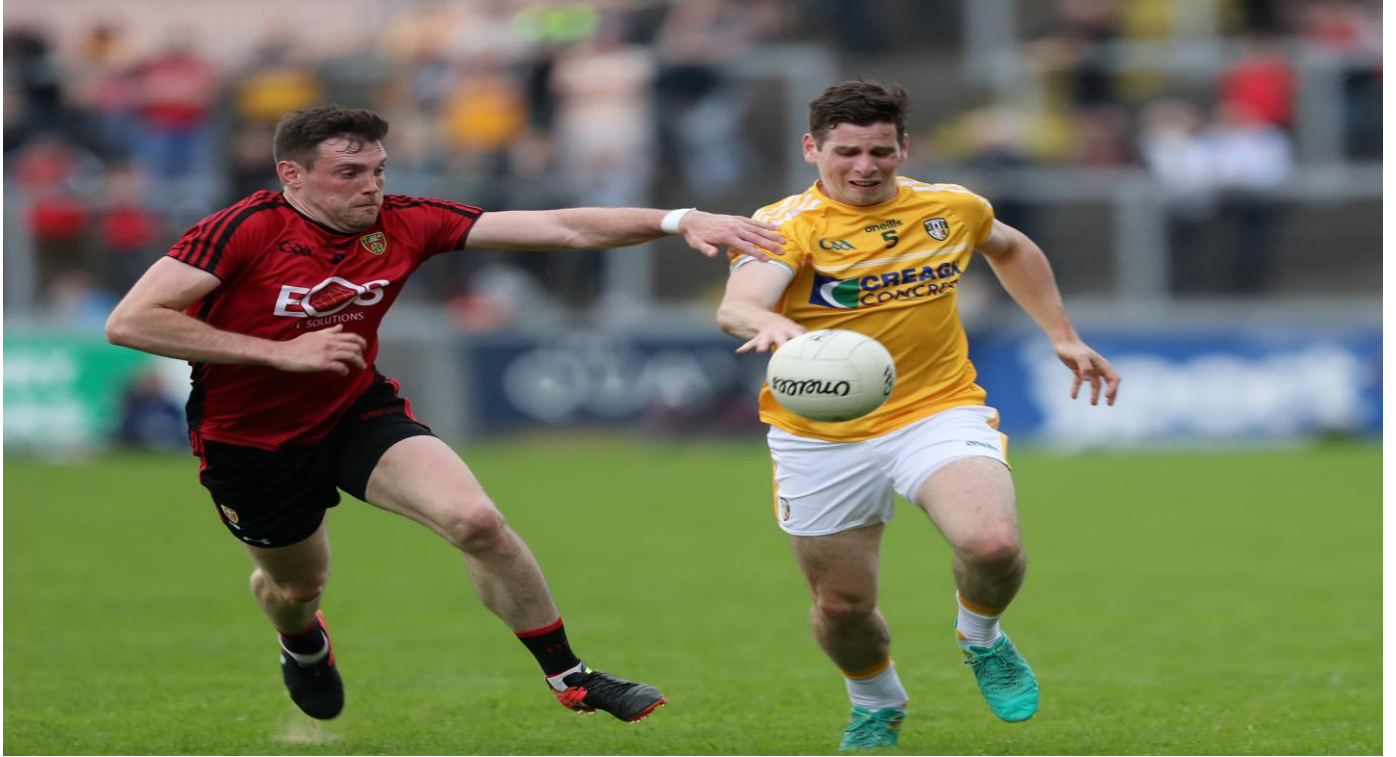
Antrim V Down