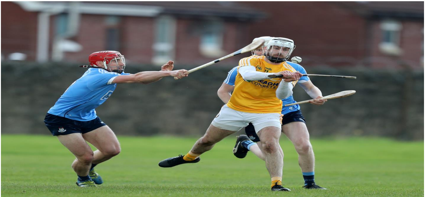
Antrim V Dublin