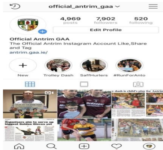
(Above – Our Antrim Instagram account which is the largest GAA account in Ulster)

Instagram is a photo and video-sharing social networking service owned by Facebook. Our Instagram account is the largest account compared to our fellow Ulster counties. Twitter has 14,859 followers and Facebook has 17,831 followers and continues to grow daily.