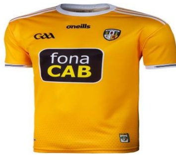
Main Jersey Sponsor