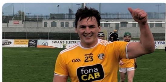
Joe McDonagh Cup: Antrim snatch draw with Carlow